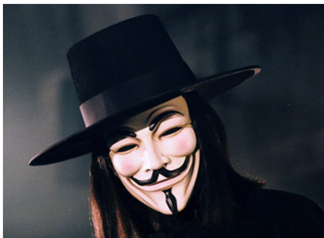
Remember, for the 5th of November, institute a Catholic theocracy in your neighborhood, today! After all, Guy Fawkes would want you to!