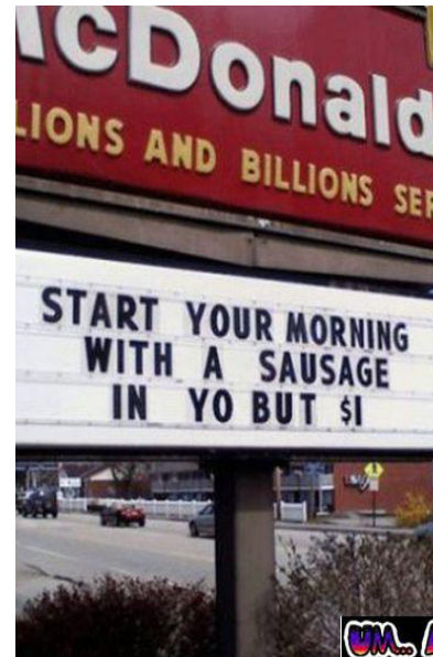
Who doesn't want a sausage in the butt for the morning! I know I do!...n't...